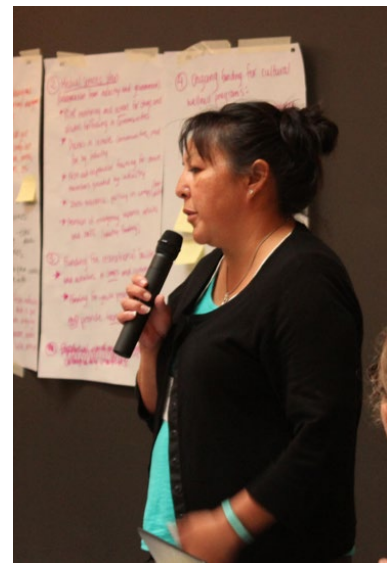
The values that are set at an industrial camp can influence how women are treated at the site, and interactions in the area.

The values that are set at an industrial camp can influence how women are treated at the site, and interactions in the area. This report referred to the values and worldview associated with ‘Rigger Culture’, which tend to promote sexist and even misogynistic views of women. Sometimes racist or ill-informed views are held towards Indigenous people. This can only be changed through policies, programs, and in depth relationships with local peoples.